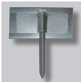
ND GARDLINER® SteelLight 110V