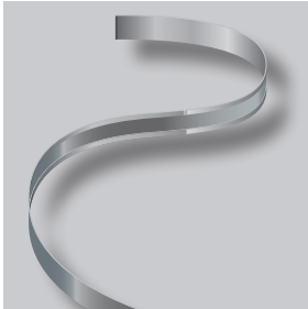
ND GARDLINER® SteelLight

GARDLINER® SteelLight 210VH with a height of 210 mm is a flexible edge retaining profile made of galvanized steel and forms a permanent border between planted areas and paved areas. Measuring 0.9 mm, the pliable profiles can be easily shaped into tight lines and flowing curves. The upper and underside of the profiles on one side are fitted with a 3-mm thick covering.