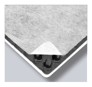
ND 820 Drainage System