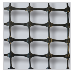
ND ESG-40/40 Erosion Protection Grid

A geogrid for steep pitched roofs with extensive vegetation, for securing the ND Erosion Protection Profile and the ND Erosion Protection Clip, or for attaching the ND SM-50 Substrate Panels. The ND ESG-40/40 Erosion Protection Grid is being placed on top of the ND 100 Drainage System.