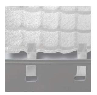
ND Erosion Protection Profile

The ND Erosion Protection Profile is a rigid plastic profile with a construction height of approx. 45 mm. The profile has punched, slotted holes for fixing the ND Erosion Protection Profile with the ND Fixing Clip to the ND ESG-40/40 Erosion Protection Grid. The profile will hold the ND SM-50 Substrate Panels in place.