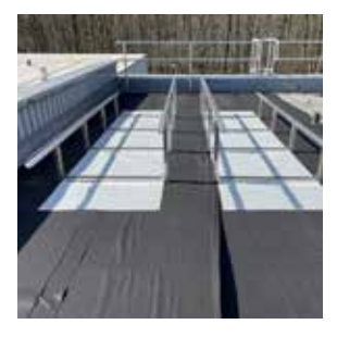
ND Solar Mounting System for Green Roofs