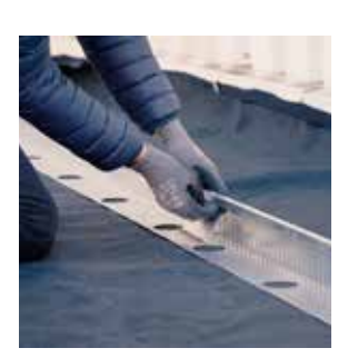
ND KL Separation and Roof Edge Profiles easy connection