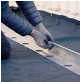
ND KL Separation and Roof Edge Profiles easy connection