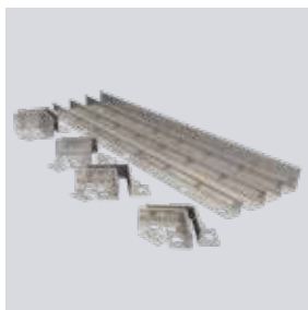
ND KL Separation and Roof Edge System

The ND KL ND Separation and Roof Edge System Profiles are straight aluminum profiles that can be used as a separation between extensive vegetation and a vegetation-free zone, but also as a roof edge for an extensive green roof. Corners are easily created with the special inner and outer corner profiles. The profiles are quickly and easily clicked together with the connecting pieces. The profiles are quickly and easily clicked together with the connecting pieces.